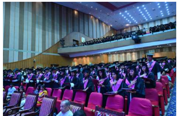
B.Com (F&A) Batch of 2022-23 taking oath in the convocation