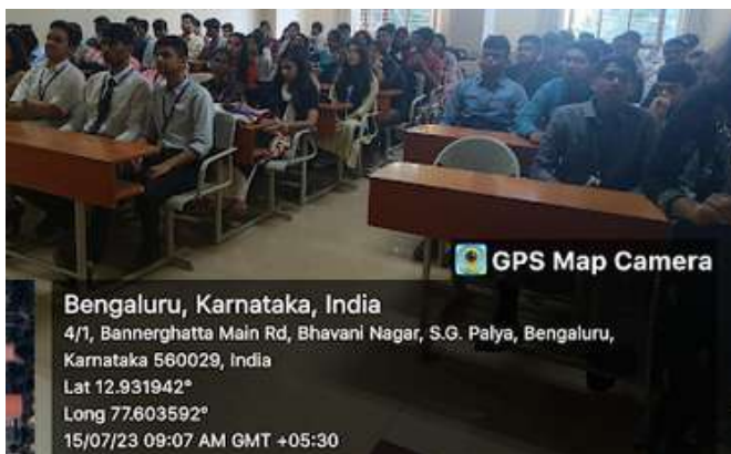
Students of First year B.Com (F&A) D