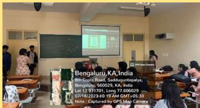
Students of First year B.Com (F&A) C