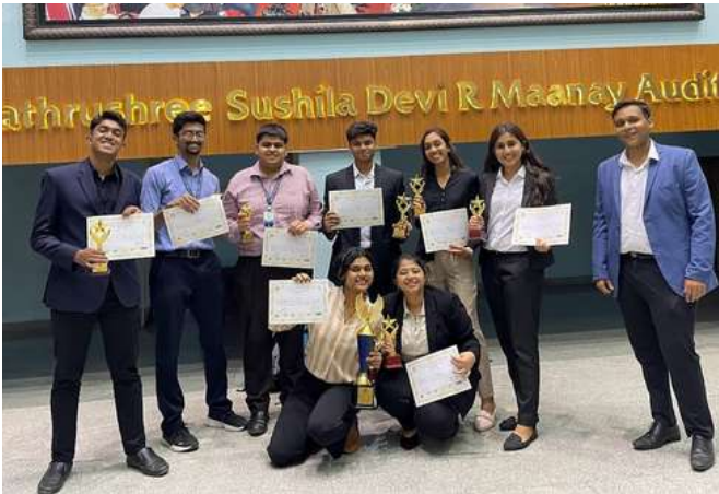
Participants in the Aarohan (BNMIT) Business Fest and Quiz