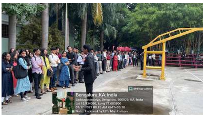
Students of First year B.Com (F&A) A

This tour not only helped the freshers acquaint themselves with the campus but also provided an opportunity to build connections with their peers and seniors. It allowed them to appreciate the campus' beauty and anticipate the memorable experiences they would have during their next four years at the university.