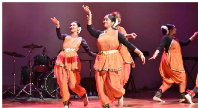
Cultural Performance by B.Com (F&A) students during Confluence 2023 Valedictory