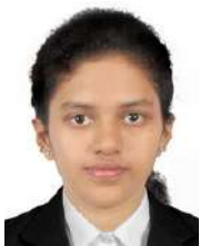
Gnanabanu C 2012045