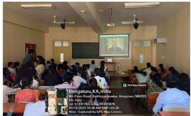
Students of First year B.Com (F&A) A during the alumni interaction