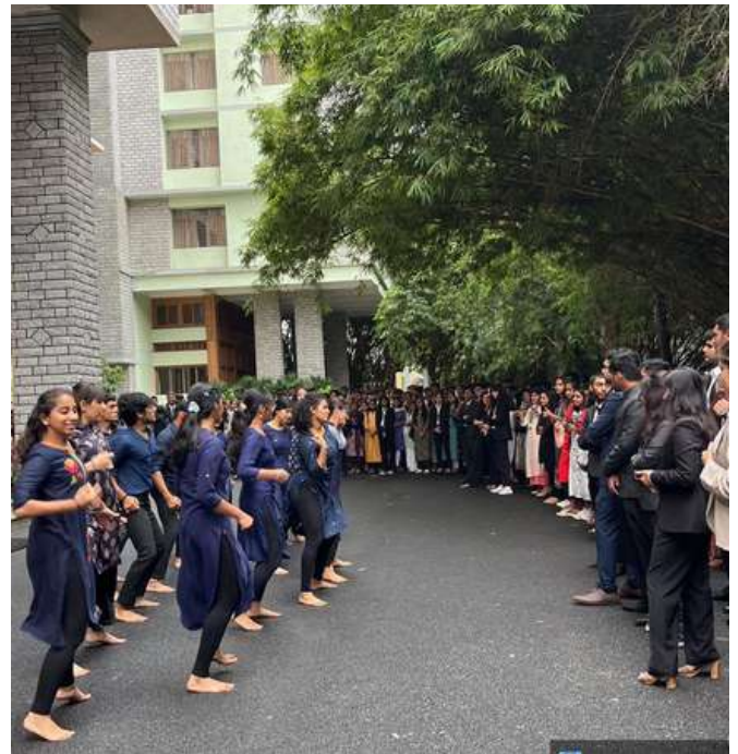
Welcome performance by the seniors

This year Confluence took place from July 12 to August 5, 2023, across various venues on campus. The freshers' active participation and excitement throughout the event made it a resounding success. This event provided valuable insights to newcomers and empowered them to embark on their academic journey with confidence and enthusiasm.