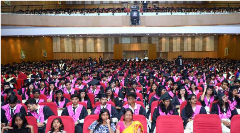
B.Com (F&A) graduates of 2020-23 present in the convocation gathering