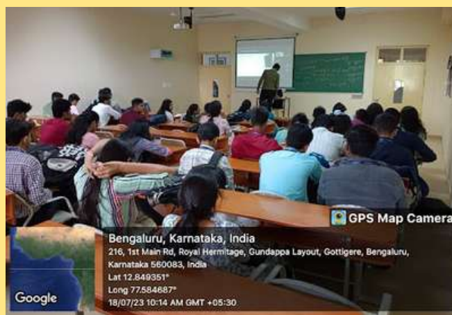
Students of First year B.Com (F&A) D during the guest lecture