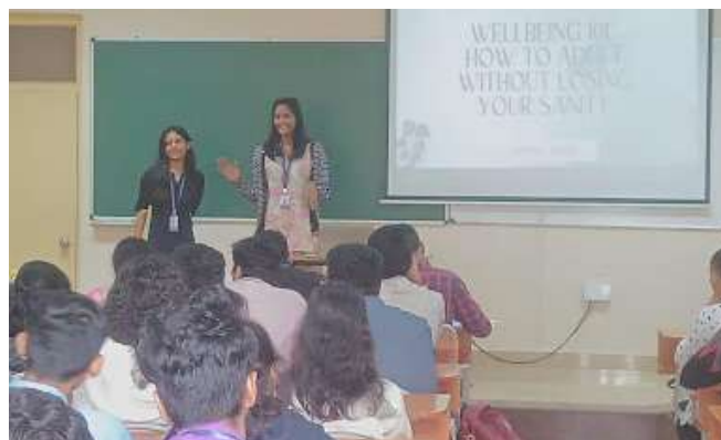
Students of First year B.Com (F&A) A

The session also delved into the importance of physical health, nurturing one's mental well-being, and fostering a balance. Around 320 students of First-year B.Com (F&A) benefitted out of this session.