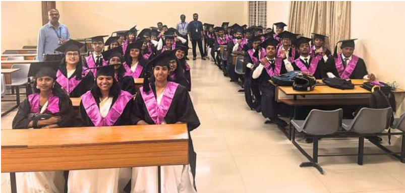
Graduates of B.Com (F&A) B section along with faculty members