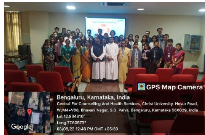
The first aid certification programme