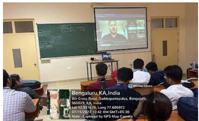
Students of First year B.Com (F&A) C