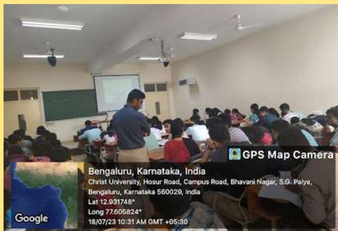
Students of First year B.Com (F&A) A