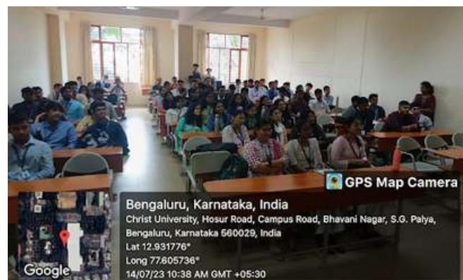
Students of First year B.Com (F&A) D