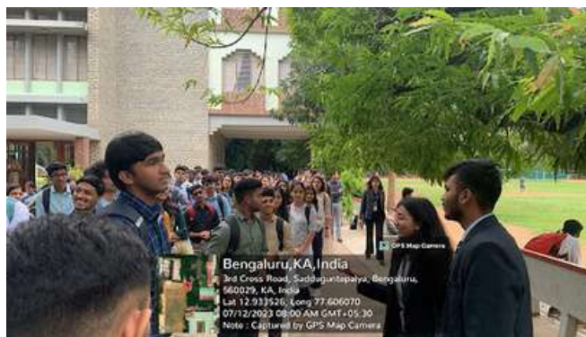
Students of First year B.Com (F&A) D