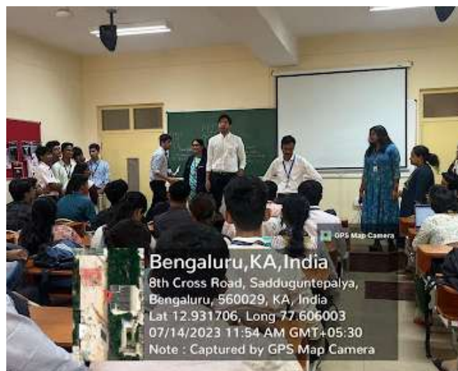
Students of First year B.Com (F&A) B