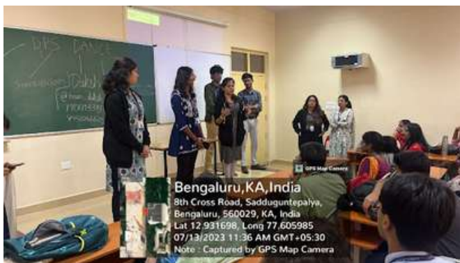
Second and Third Year Students addressing the First Year Students