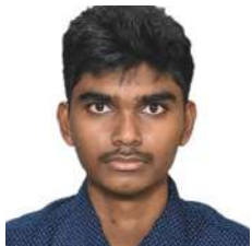
Prem S.J 2112231