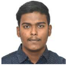
Sudan Subbu S 2112135