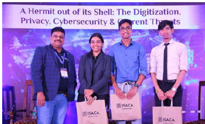
B.Com (F&A) students with the dignitary