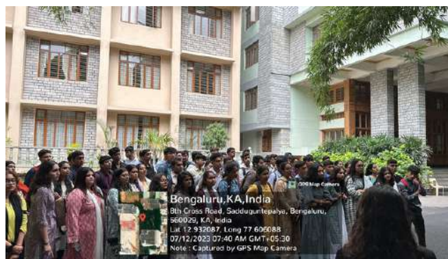
Students of First year B.Com (F&A) B