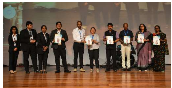
Magnate core team members along with the Director, Head of the Department and Academic Coordinators