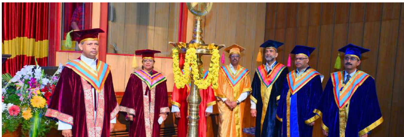
Dignitaries at the lighting of the lamp