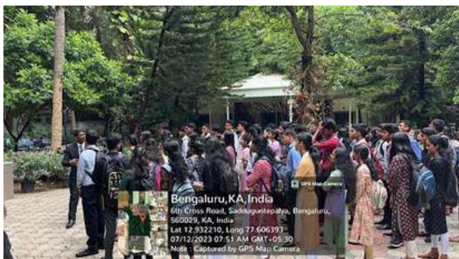
Students of First year B.Com (F&A) C