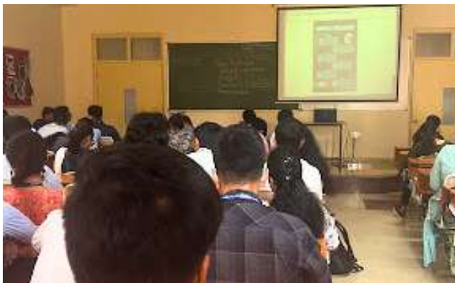
Students of First year B.Com (F&A) A