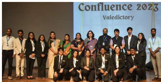
Confluence 2023 Core committee members