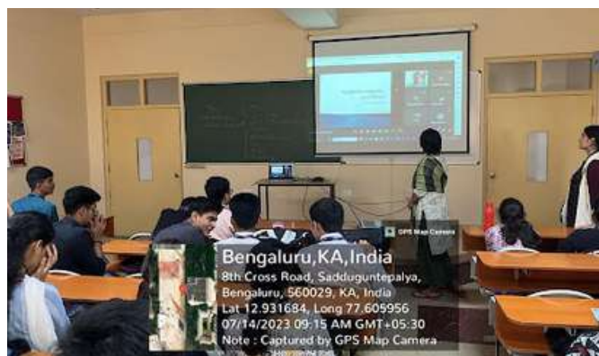
Students of First year B.Com (F&A) C