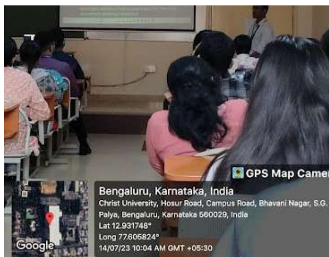
Students of First year B.Com (F&A) A

The session catalyzed inspiring students to uphold honesty in their academic endeavors while equipping them with indispensable skills and knowledge pivotal for a prosperous future career. Furthermore, the session significantly contributed to the establishment of trust and mutual respect among peers and professors alike. More than 300 students actively participated in the session, followed by an engaging Question and Answer session that further enriched the learning experience.