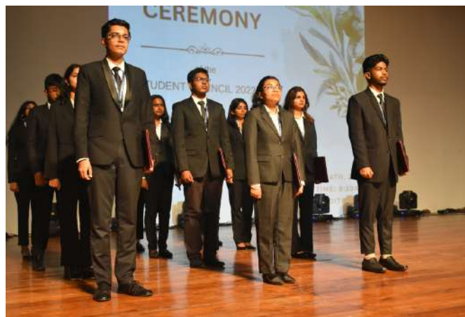
Induction of the SSC's