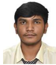
Vetrivelan C 2112041