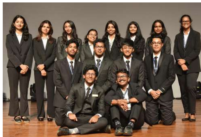
All the SSC's and the USC's of B.Com(F&A) for the academic year 2023-24